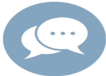
File a Comment