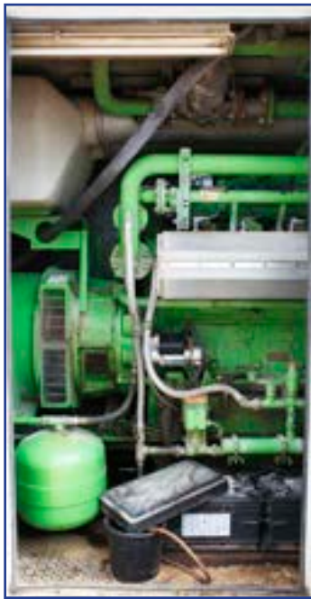
633 kW Genset

So we're just absorbing and utilizing nutrients so much better. ... This [digested manure] absorbs and infiltrates into the soil really readily, really easily. The nitrogen is very easily taken up by plants, so it just really pairs super well with our cropping system. If we had to go back to square one and just dump it in a manure pit, I would have to start really rethinking how