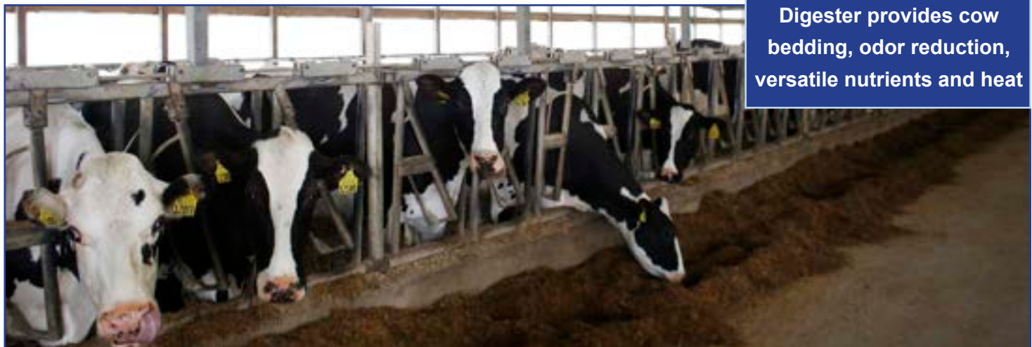
Crave Brothers Farm Dairy cows