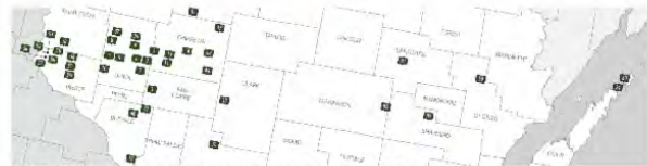
ARPA Grant Awardees Map: https://bit.ly/3ITE3UG

Learn more about the awardees and other proposed ARPA projects on the PSC website!