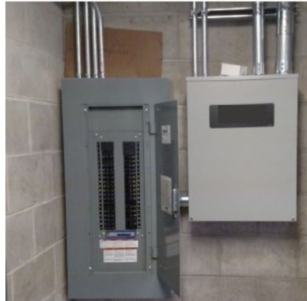
Example Transfer Switch