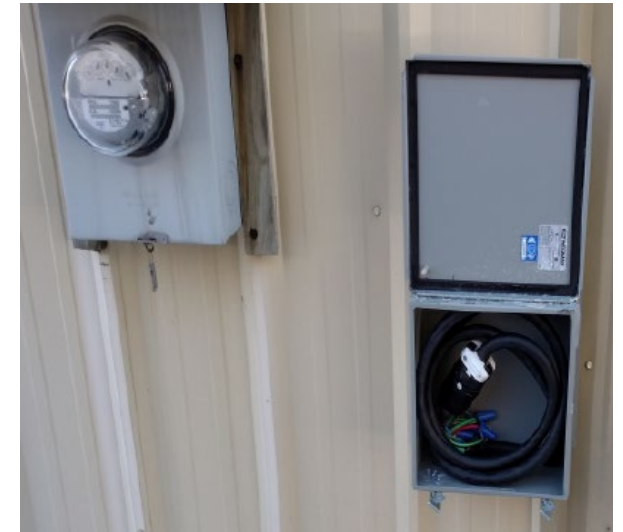
Example Connector/ Tap Box