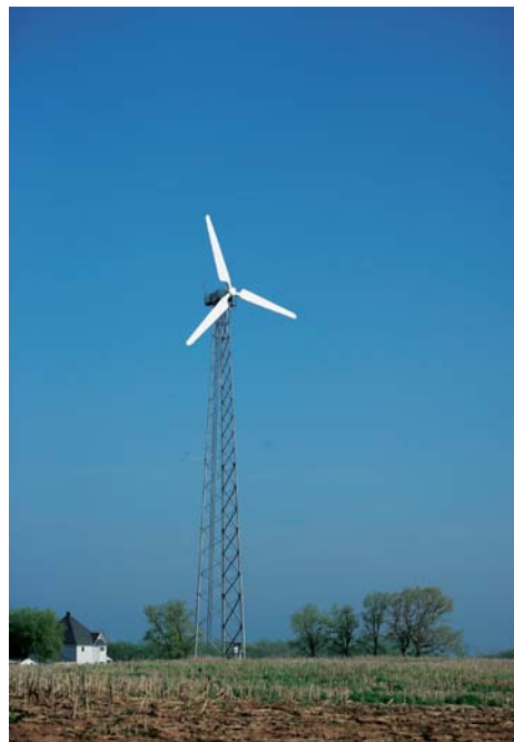
Residential wind system

There is great interest in customer-owned small wind projects of 100 kW or less. However property limitations such as trees and buildings can greatly affect wind turbine performance. As of the end of 2008, 49 small wind projects in the state have been co-funded by the Focus on Energy program, Wisconsin's statewide energy efficiency and renewable energy program.