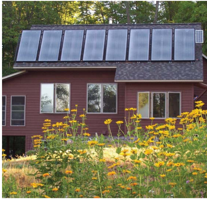
Residential solar hot water collectors