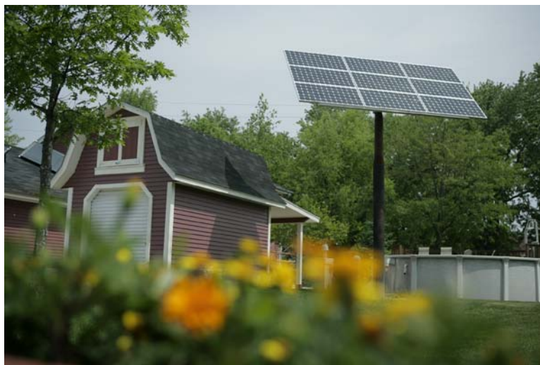
Residential application of a solar photovoltaic flag

Photovoltaic systems have experienced a high level of popularity in recent years among homeowners and businesses seeking to decrease their impact on the environment. PV systems require little maintenance, making them an attractive renewable energy option. PV arrays can also be installed on building roofs or on pole. As of the end of 2008, Focus on Energy has co-funded a total of 470 photovoltaic systems across the state.