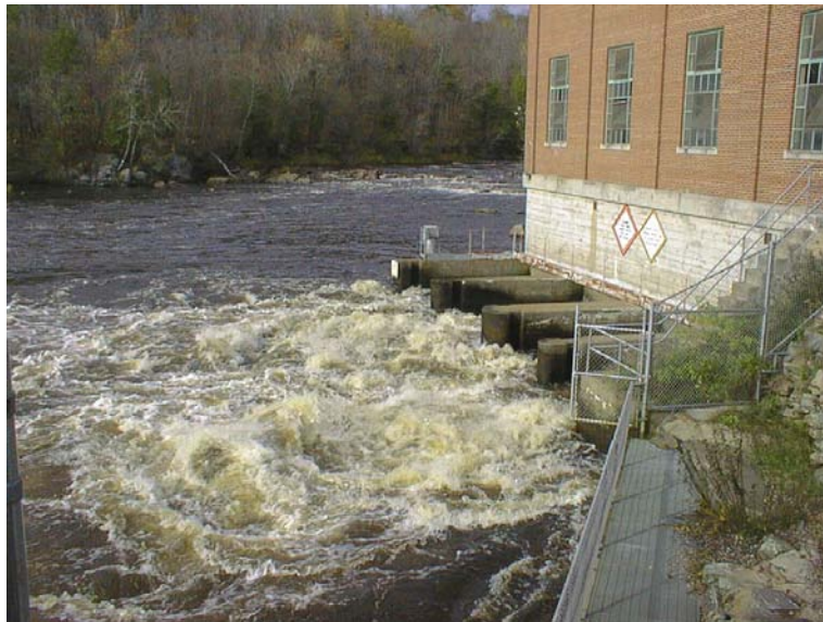
Grandfather Falls Dam along the Wisconsin River

Hydroelectric power plants produce no air emissions. Their main environmental impacts are related to the flooding of the landscape upstream, changing flows within the stream banks downstream, dividing the stream into separated pools, and damaging or killing fish. The barriers created by dams constrain fish and other species to specific pools, impacting their ability to survive and reproduce. The turbines have the potential to damage or kill fish if the fish are not filtered aside on the upstream side of the dam.