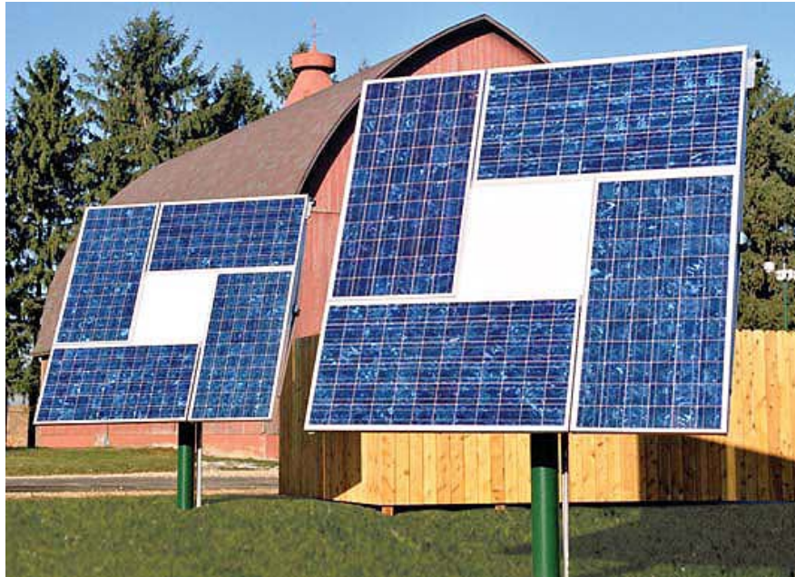
Solar photovoltaic system installed at a Dane County park

Photovoltaic systems have experienced a high level of popularity in recent years among homeowners and businesses seeking to decrease their impact on the environment. PV systems require little maintenance, making them an attractive renewable energy option. PV arrays can also be installed on building roofs or on pole. As of the end of 2008, Focus on Energy has co-funded a total of 470 photovoltaic systems across the state.