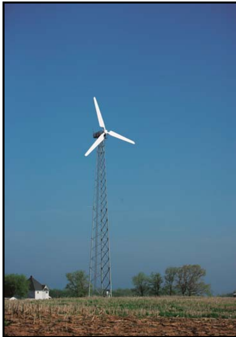
Residential wind system

There is great interest in customer-owned small wind projects of 100 kW or less. However property limitations such as trees and buildings can greatly affect wind turbine performance. As of the end of 2008, 49 small wind projects in the state have been co-funded by the Focus on Energy program, Wisconsin's statewide energy efficiency and renewable energy program.