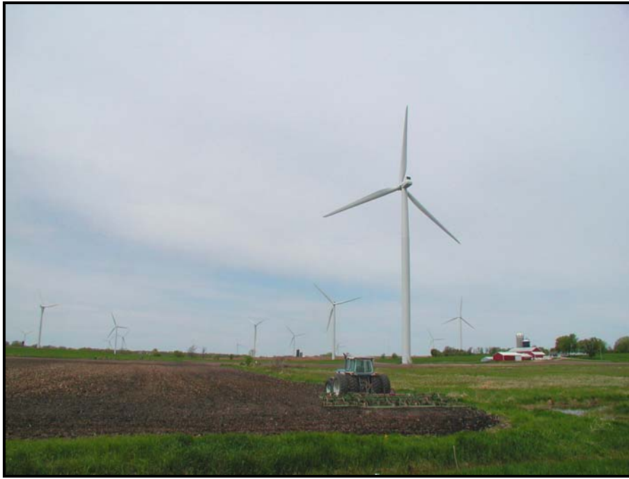
Utility-sized wind energy project in Fond du Lac County

There is great interest in customer-owned small wind projects of 100 kW or less. However property limitations such as trees and buildings can greatly affect wind turbine performance. As of the end of 2008, 49 small wind projects in the state have been co-funded by the Focus on Energy program, Wisconsin's statewide energy efficiency and renewable energy program.