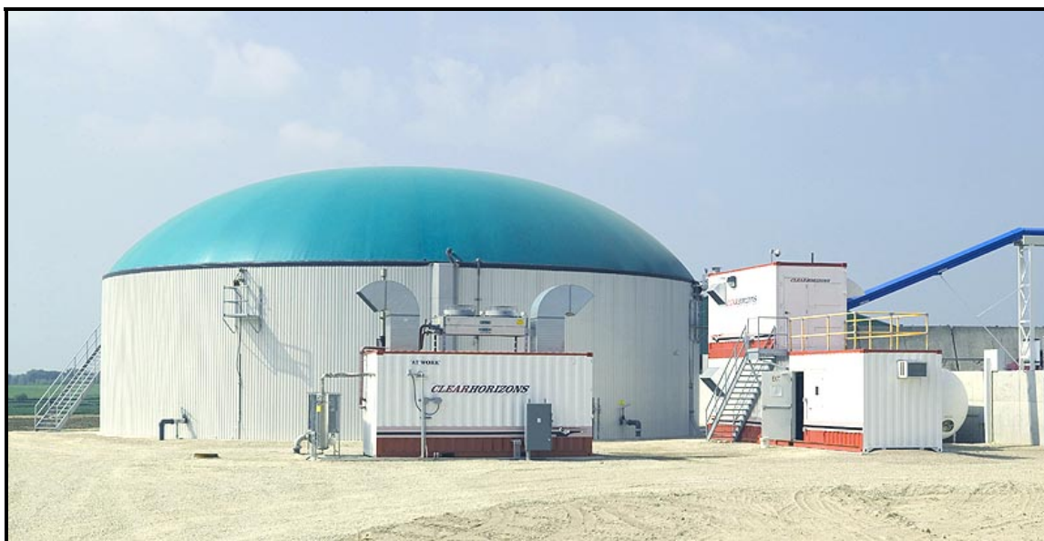
Biogas system at a dairy farm in Jefferson County

Another biological source of energy used to create electricity is biogas. Biogas is created when biological material such as livestock manure or food waste products is processed using a heated, oxygen-free process known as anaerobic digestion to produce a combustible gas. Wisconsin is considered a biogas leader in the nation. As of the end of 2008, the Focus on Energy program has co-funded 20 biogas systems in the state. A majority of these systems are anaerobic digesters at dairy farms; however, there is also a growing interest in the benefits of biogas systems at industrial food-processing plants.