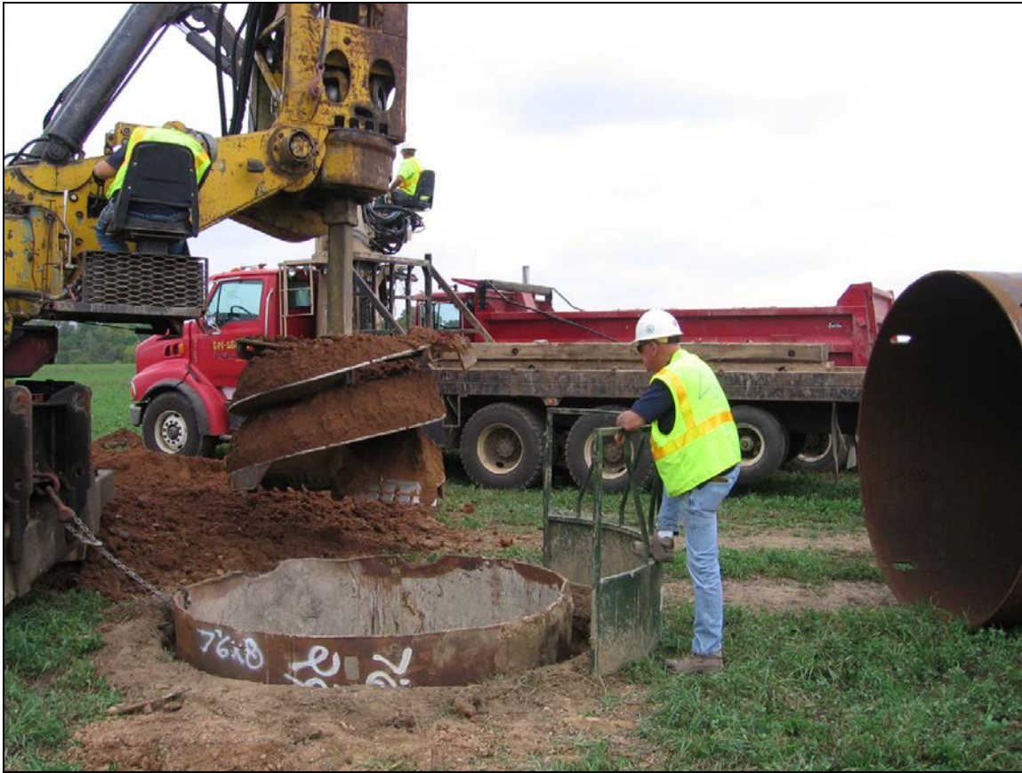
Figure Vol. 2-14 Augering a foundation excavation in dry upland soils