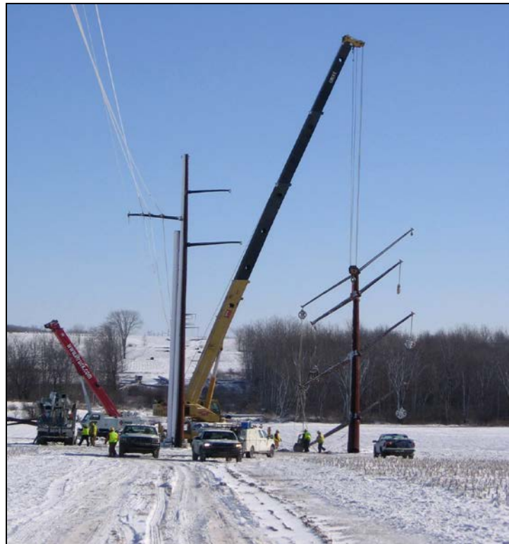
Figure Vol. 2-27 Installing the top section of the tower