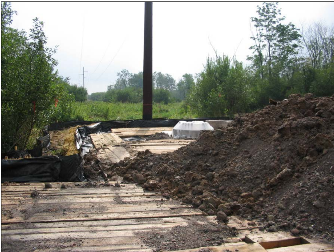
Figure Vol. 2-15 Structure location in wetland – matted work platform, foundation, spoil pile (to be removed), and erosion control