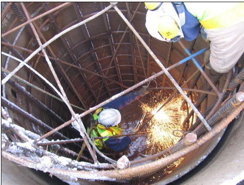
Figure Vol. 2-21 Final rebar work in preparation for concrete pour