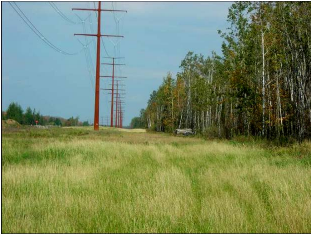
Figure Vol. 2-24 Upland ROW seeded with oats and rye grass for quick soil stabilization while native vegetation re-establishes