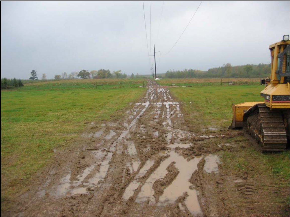
Figure Vol. 2-32 Minor soil rutting in pasture land