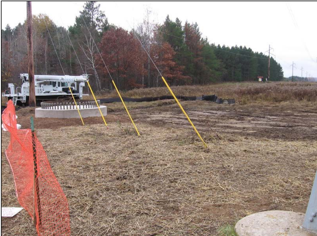
Figure Vol. 2-23 Completed foundation after initial cleanup