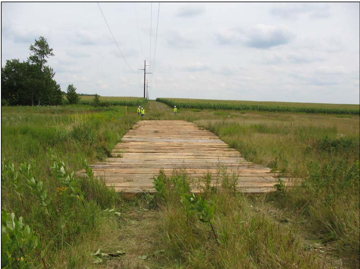
Figure Vol. 2-39 Mats in wet meadow