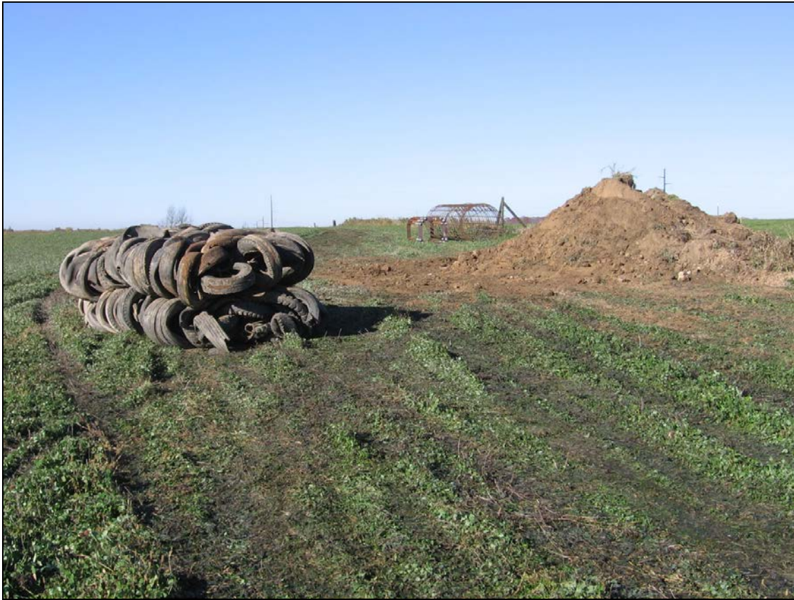
Figure Vol. 2-18 Blasting mats and post-blast soil/rubble pile