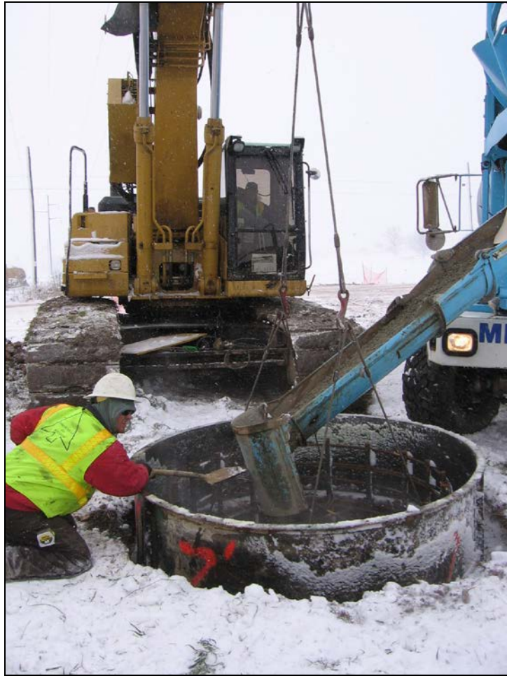
Figure Vol. 2-22 Pouring the concrete foundation