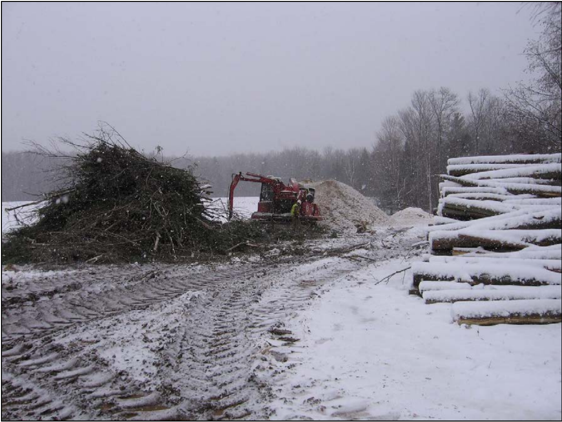
Figure Vol. 2-12 Chipping slash on upland ROW