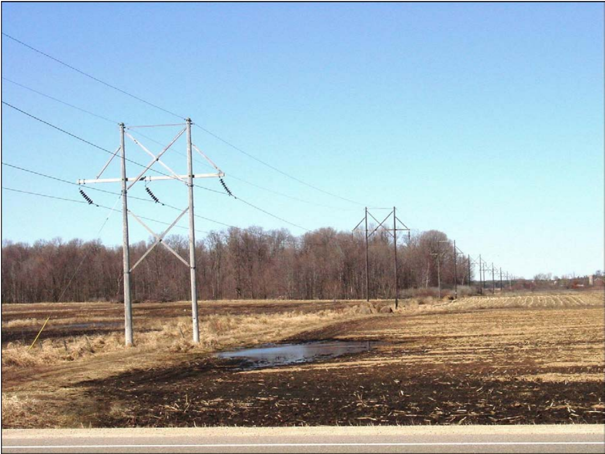
Figure Vol. 2-8 Typical two-pole H-frame structures