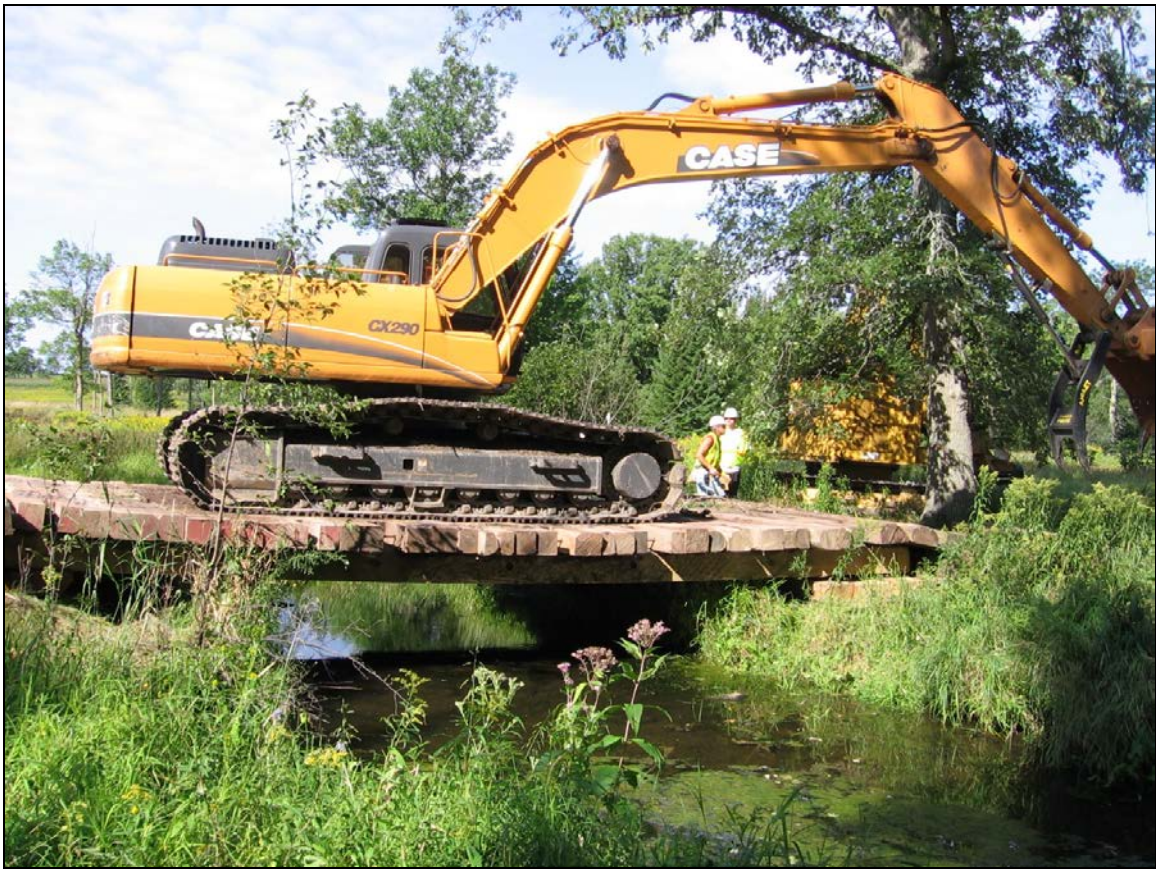
Figure Vol. 2-38 Timber mat equipment bridge at stream crossing