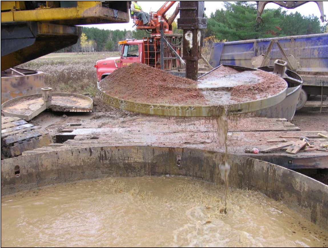
Figure Vol. 2-16 Augering in unconsolidated material (i.e gravel) – flooding of the excavation is necessary to prevent the sides from collapsing