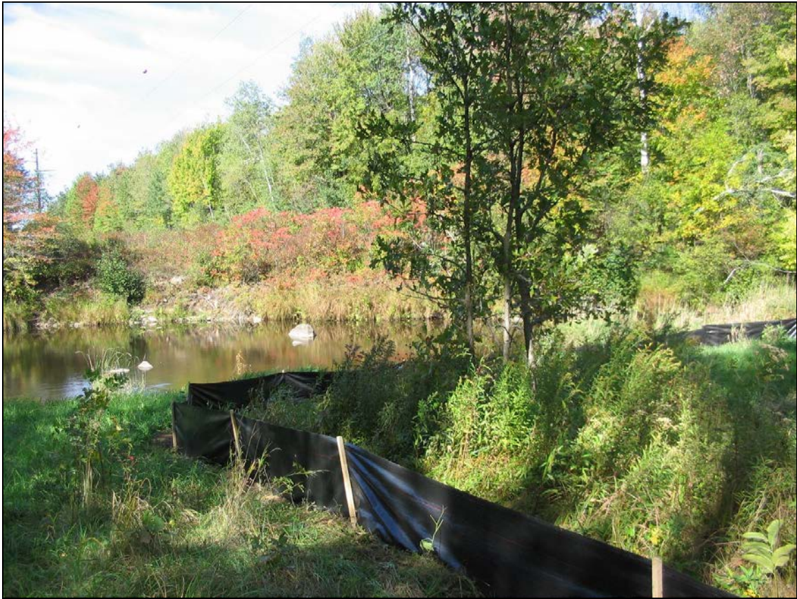
Figure Vol. 2-36 Turtle exclusion fence