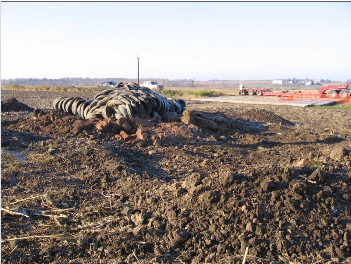
Figure Vol. 2-17 Prepared blast location – topsoil stripped and stockpiled off to side prior to blast and blasting mats in place