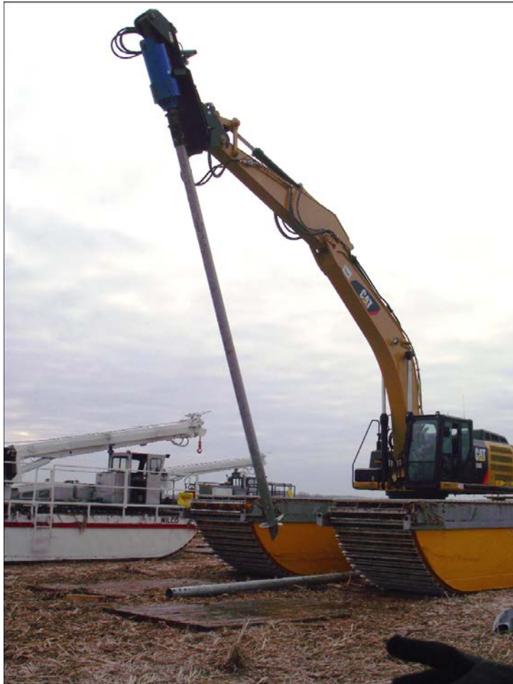
Figure Vol. 2-26 Installation of a helical pier foundation in a wetland with a marsh buggy