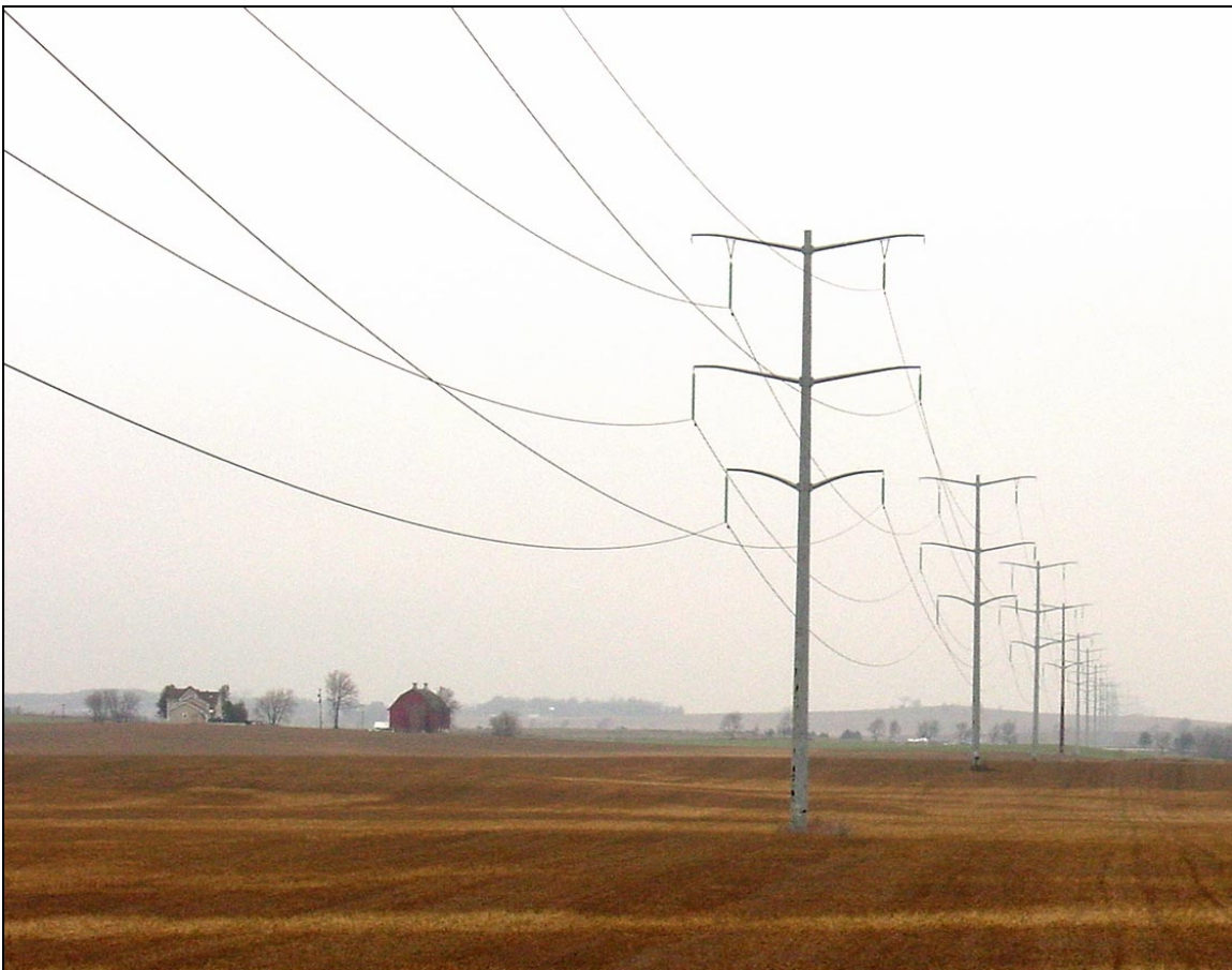
Figure Vol. 2-9 Typical single-pole double circuit structures