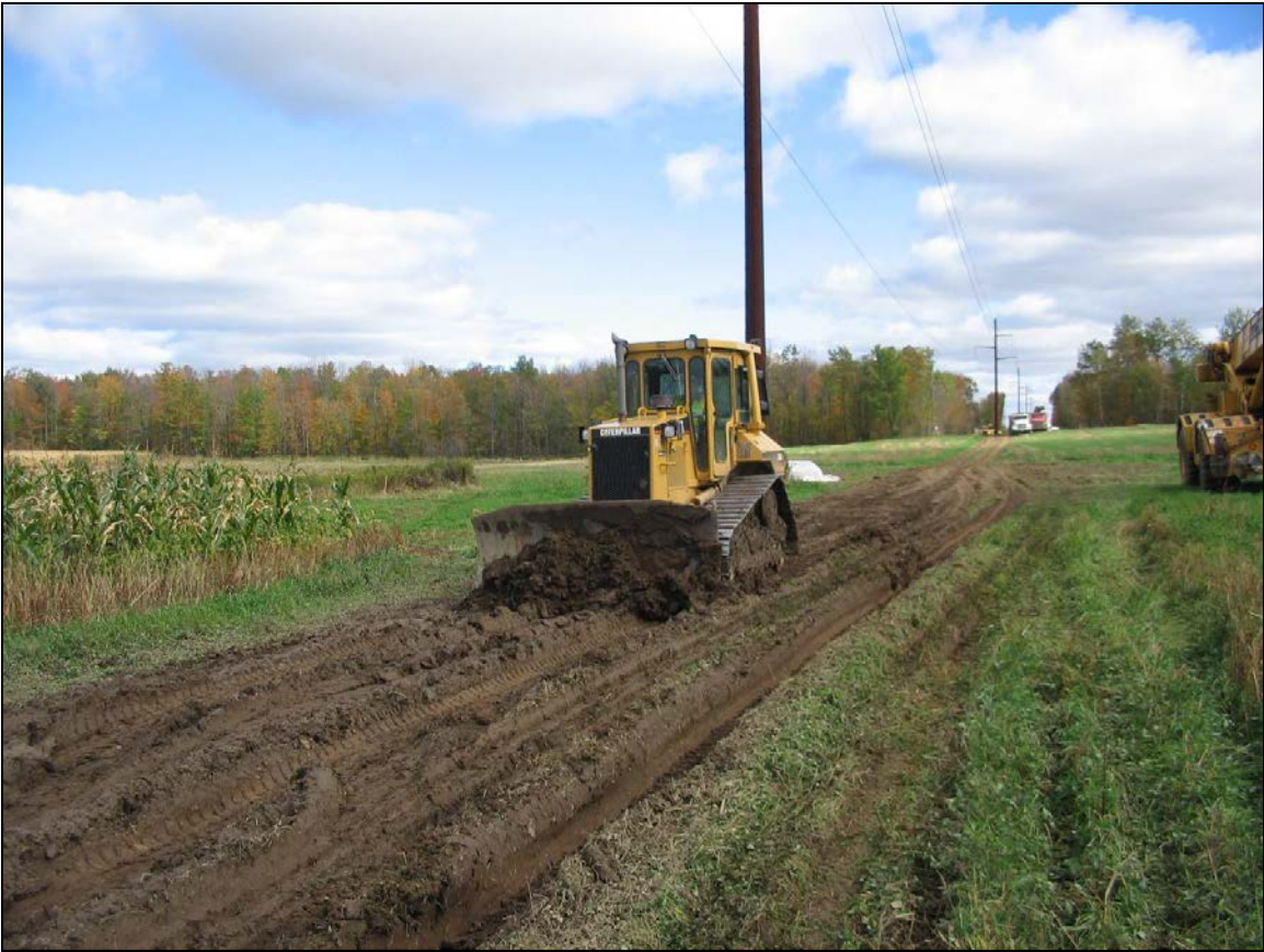
Figure Vol. 2-34 Ruts being smoothed with blade