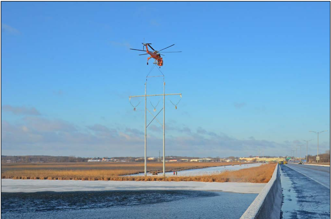
Figure Vol. 2-29 Helicopter setting tower on foundation