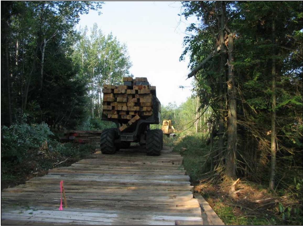
Figure Vol. 2-40 Timber mats being placed in wooded wetland