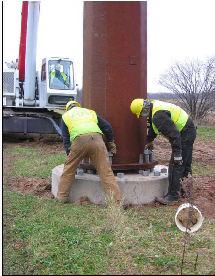
Figure Vol. 2-28 Bolting tower to concrete foundation