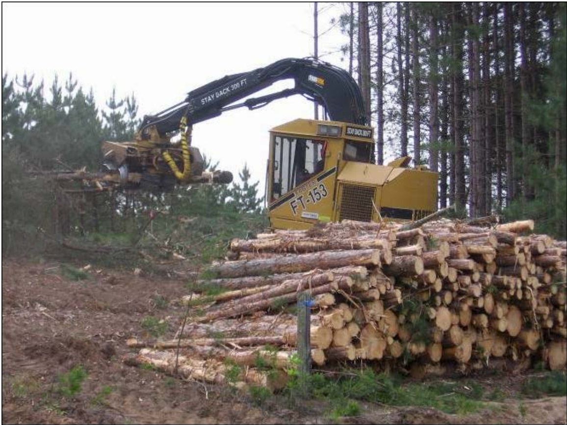
Figure Vol. 2-10 Tree processor used for clearing – capable of cutting a standing tree, de-limbing it, and sawing it into logs