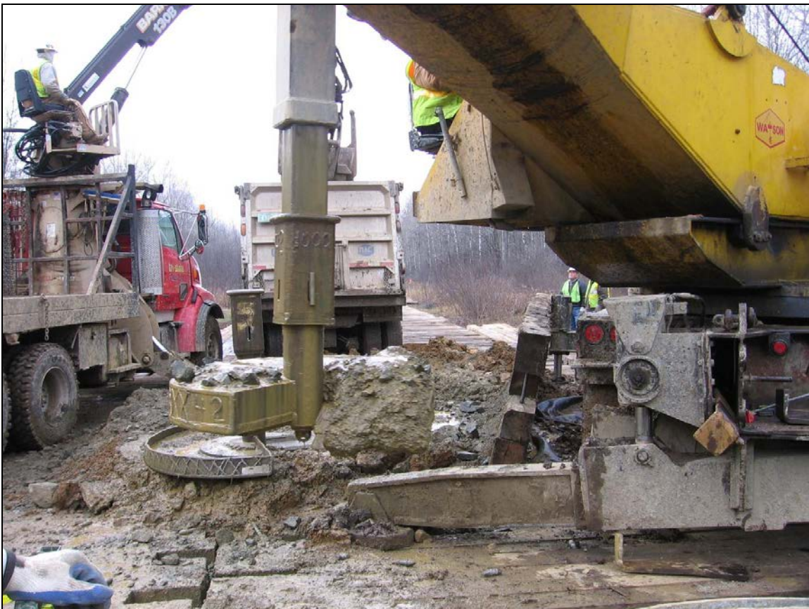
Figure Vol. 2-19 Augering rocky subsoils