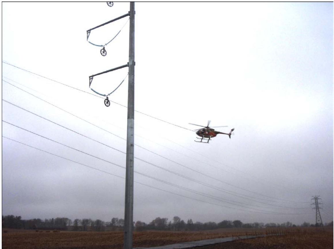
Figure Vol. 2-31 Wire stringing with a helicopter