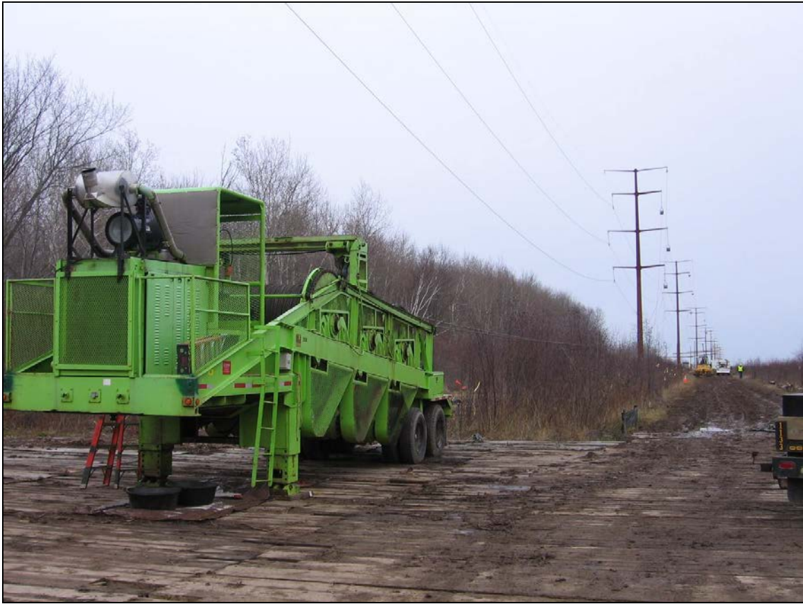
Figure Vol. 2-30 Pulling cable through structure arms