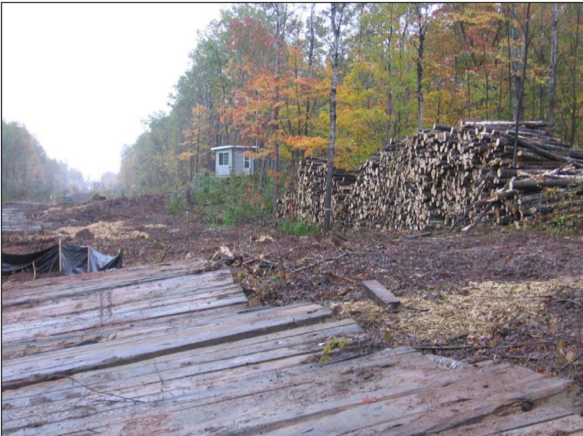
Figure Vol. 2-13 Timber piled on edge of ROW