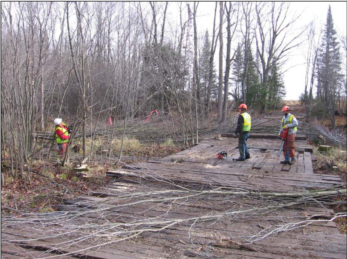
Figure Vol. 2-11 Hand-clearing along a flood channel