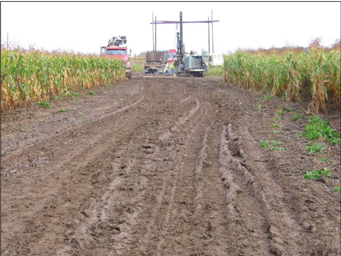
Figure Vol. 2-33 Rutting of topsoil in cropland – no soil mixing