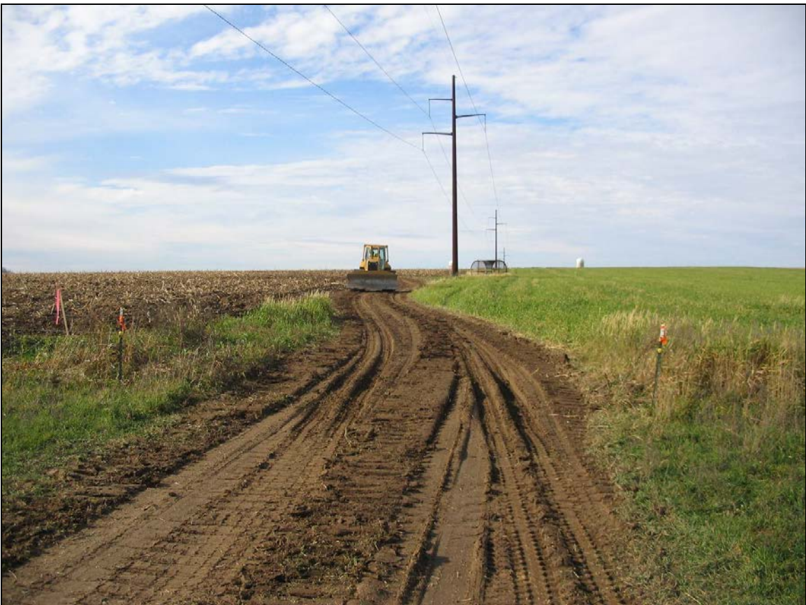
Figure Vol. 2-35 Smoothing out ruts by backblading with a dozer