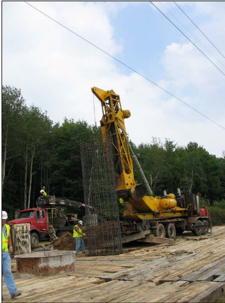
Figure Vol. 2-20 Placing foundation cage inside the excavated hole